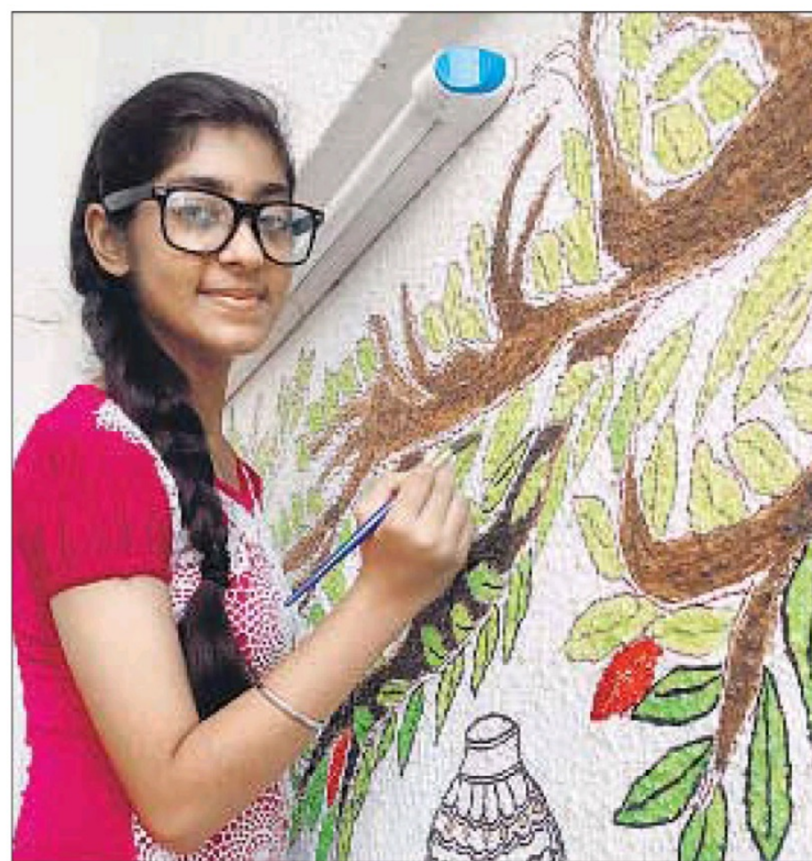
■ At Art Orbit in Bandra, you can try your hand at Madhubani, a tribal art form from the Mithila region of Bihar. (Extreme left) You can give the pottery wheel a spin at Kindles in Kandivli.

MOHAN GIRI GROUP concrete steps to the future