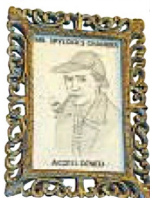
■ Play Sherlock with friends at Clue Hunt.