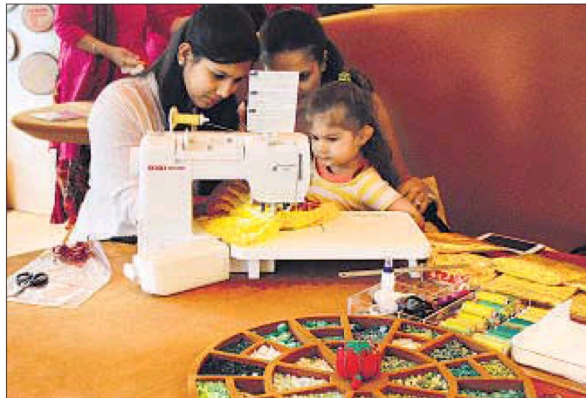
■ At The Hab in Khar, young ones and adults can try their hand at stitching and embroidery. You can play with clay for three hours at a time at Studio Pottery in Bandra.